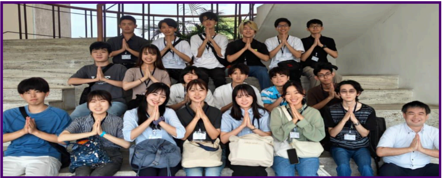
SCIE hosted a batch of 19 students with 1 faculty person from Chiba University, Japan on Study India Program for a week