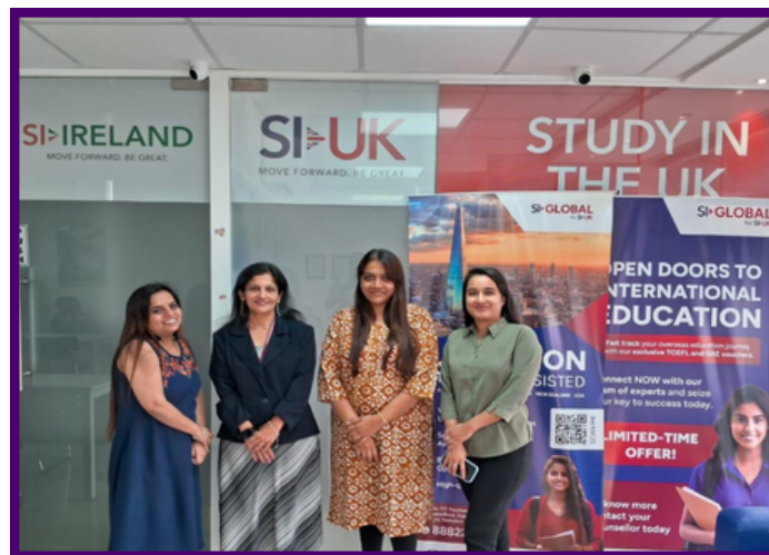
Training Sessions were conducted by the Collaborations team at Global Colliance, Vadodara and for SI UK for their offices at Vadodara and Ahmedabad in Gujarat and at Bandra and Andheri in Mumbai, Maharashtra